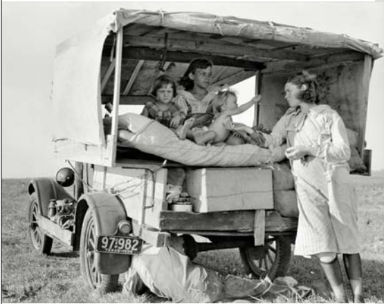
Dorothea Lange 1895-1965